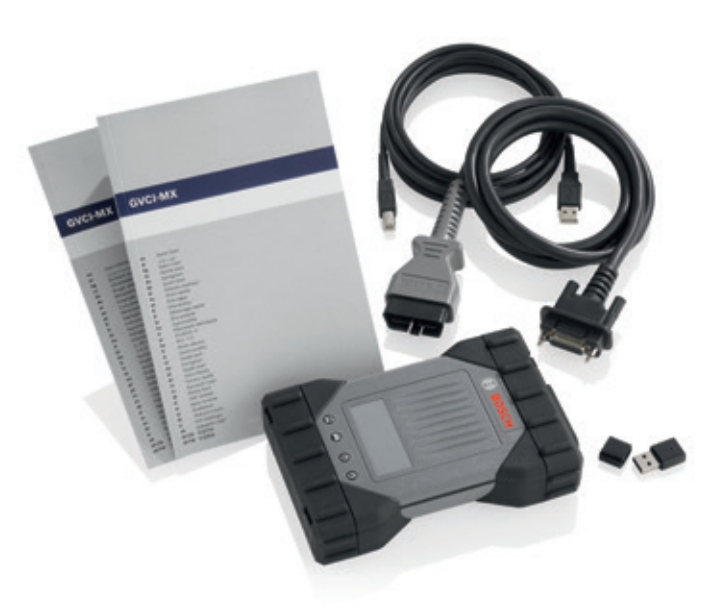
G-VCI MX with P2P Wi-Fi: kit contents

The GVCI-MX VCI input voltage range is from 8 to 28 volts. The GVCI-MX supports 24-volt systems used in light and heavy trucks.